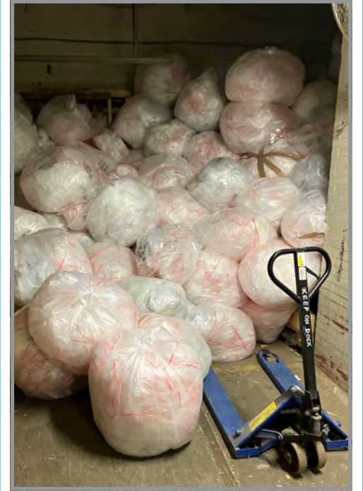
Members of he Rotary Club of White Oak is collecting plastic for a recycling project that benefits their community. Pictured above is some 1,200 lbs of plastic that will be used to produce two plastic park benches.