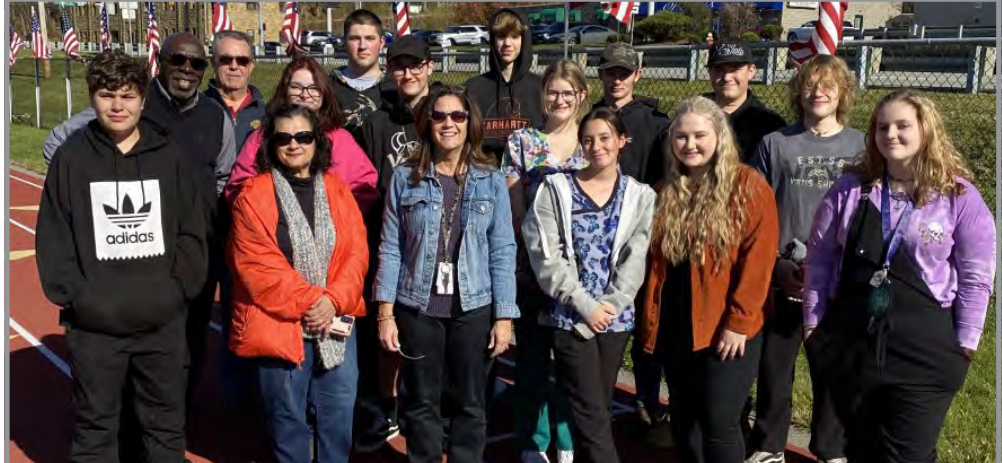
The Burrell-New Kensington Rotary Club erected a Flag Display to commemorate Veterans' Day at Valley High School in New Kensington. About 35,000 vehicles pass by each day and several honked horns as they were putting them up. In addition to club embers, Interact students from Valley and students from Northmoreland Career and Technology Center assisted. The Veteran Salute will be up for 10 days and the club will do it again for Memorial Day. The club appreciates the grant they received at the District Conference which enabled them to expand the Display.